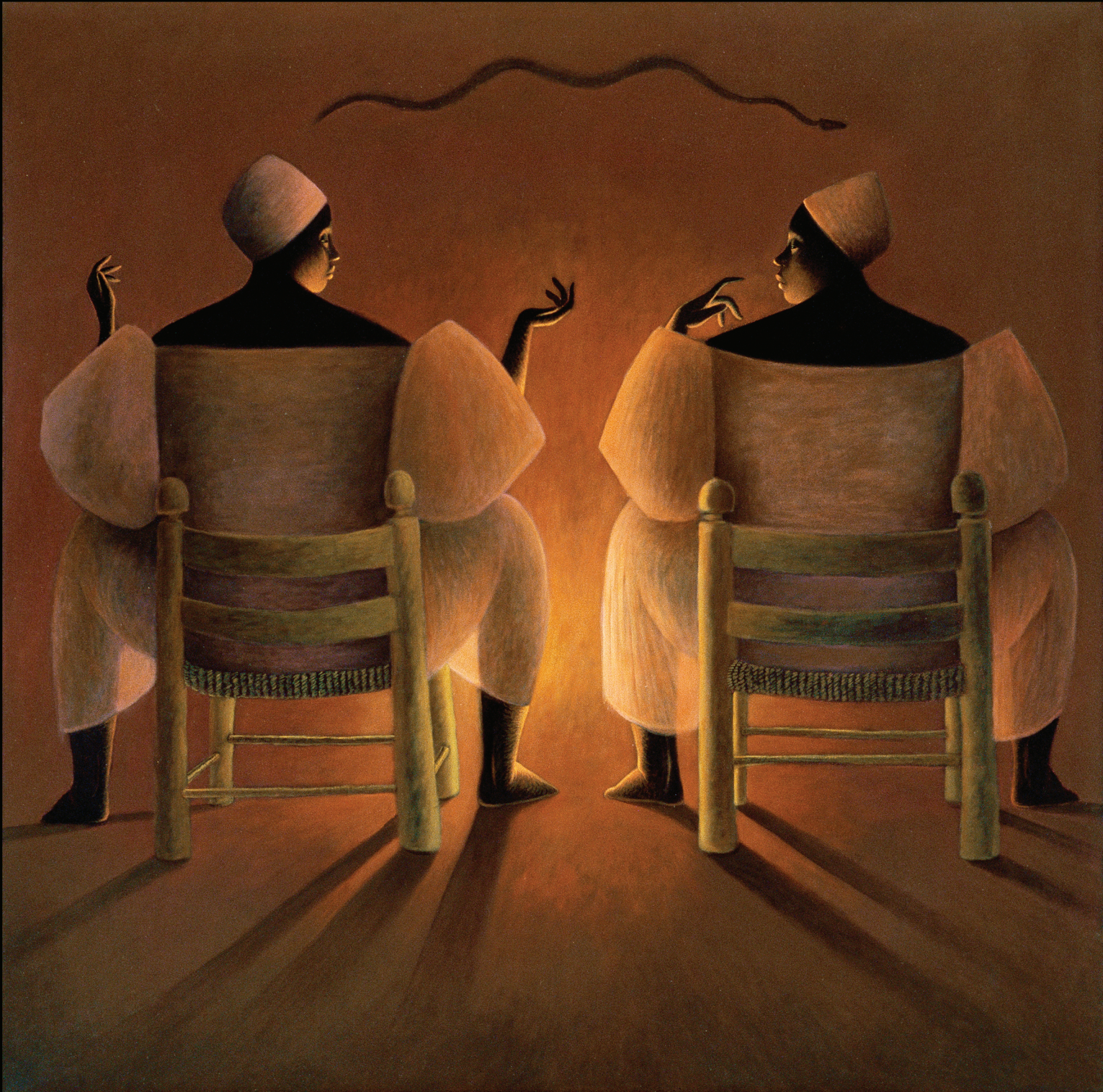
Painting © François Gauvin; reprinted with permission

November 1–3, 2017 • New Orleans, Louisiana